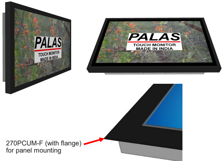
270PCUM-F (with flange) for panel mounting

Unique metal frame PCs for use in harsh environments. Rugged design. Easy mounting through VESA mounts. Anti-reflective.